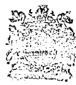
EVAN WALKER MINISTER FOR PLANNING AND ENVIRONMENT

APPROVED BY THE GOVERNOR IN COUNCIL 19 JUN 1984. Tom Hamilton CLERK OF THE EXECUTIVE COUNCIL