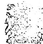
Evan Walker Minister for Planning and Environment

APPROVED by the Lieutenant Governor as Deputy BY THE GOVERNOR IN COUNCIL